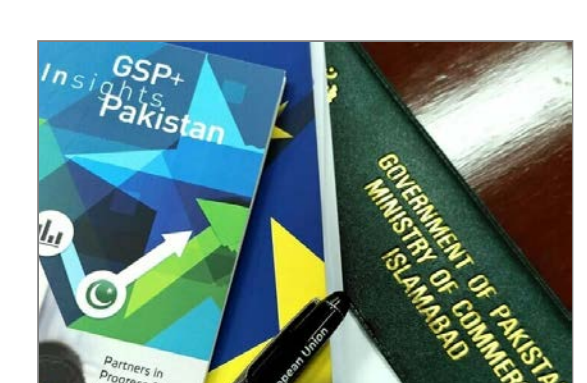
Pakistan's EU exports fall despite GSP+ status

Pakistan's exports to European countries have begun to dip in the current fiscal year despite a GSP+ status that allows duty-free entrance into European markets for the majority of its products.