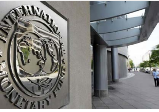
IMF, Pakistan reach staff-level agreement on final bailout review

The International Monetary Fund (IMF) has reached a Staff-Level Agreement (SLA) with Pakistan on the final review of a US$3 billion bailout, where the country will receive $1.1 billion after approval from the Fund.