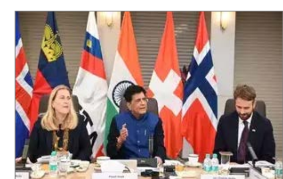
India inks pact with EFTA, gets $100 billion commitment

India signed a trade and economic partnership agreement with the European Free Trade Association (EFTA), a grouping of Switzerland, Norway, Liechtenstein and Iceland, that includes a binding $100-billion investment commitment.