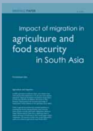
Policy Brief: Impact of migration in agriculture and food security in South Asia Author: Purushottam Ojha Publisher: SAWTEE