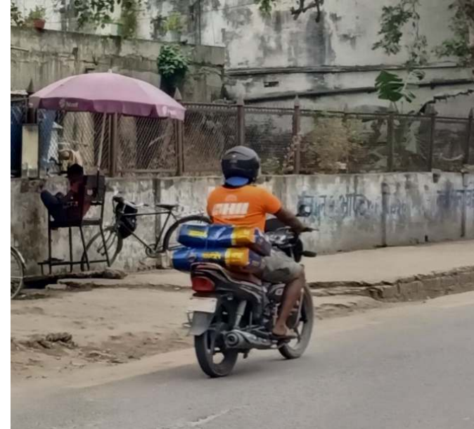
Blackia crossing the Nepal-India border in Birgunj with sacks of rice.