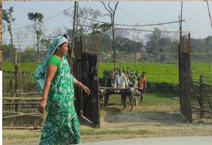
A woman walks past a gate in the India-Bangladesh border fence at Phansidewa as employed as tea garden worker.