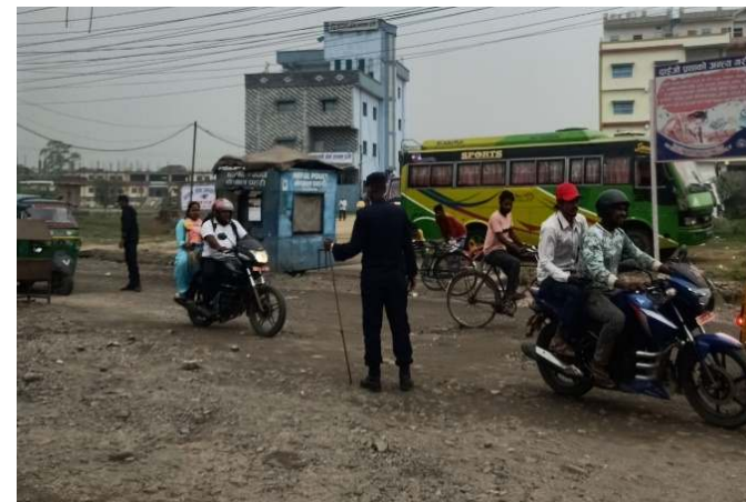
Random checking at Birgunj, Nepal-India border